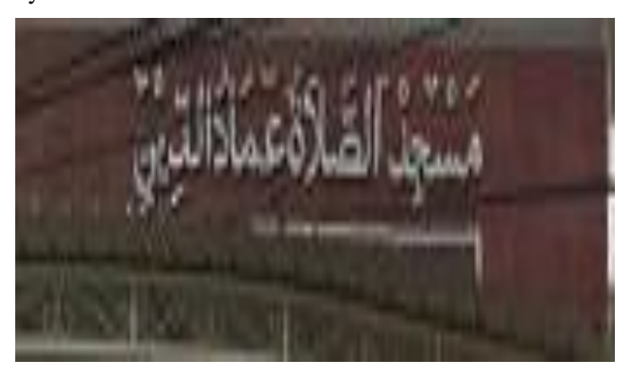
Figure 12. Mosque with Arabic script

From table 11, Arabic (script and/or lexicon) is involved in 79 data (87.8%). This situation indicates that Arabic has become an important language in conveying religious messages. Islamic symbols, such as monotheism, holy verses of the Koran, Islamic figures, and Islamic expressions, are played in educating and instilling the love of worshipers towards their religion. Although Arabic is studied and used in a limited domain (madrasas, Islamic boarding schools, Islamic universities), this does not rule out the use of Arabic and its script in massive communication in society. With the majority of Muslims, the use of Arabic is not only considered to understand its meaning, but rather the strengthening of Islamic symbols.