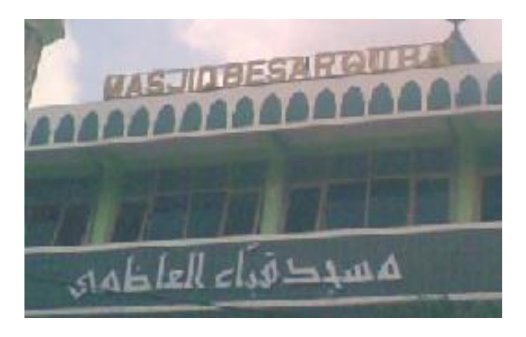
Figure 1. The mosque name which replicates the Quba Mosque name in Medina

From the survey, researchers found six types of information. This information appears in signs on the signboard of places of worship, namely (1) identity (2) owner (3) Islamic sector organization, (4) warning, (5) promotion, (6) location marker/address. The names of places of worship were taken from the surah in the Koran, Muslim leaders, heroes, and Islamic quotes. There is a mosque name that resembles the name of a mosque in the City of Medina, Saudi Arabia.