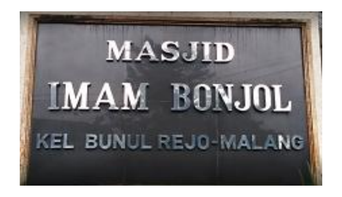
Figure 6. Street name use as mosque name

Figure 6 is an example of the location marker where Imam Bonjol Mosque is located on Jalan Imam Bonjol Malang. With the vast area of Jalan Imam Bonjol, Imam Bonjol Mosque can be a location marker. For example, when someone asks about a place in the Imam Bonjol Street area, information can be given by referring to the area near the Imam Bonjol Mosque (if the area is close to the mosque).