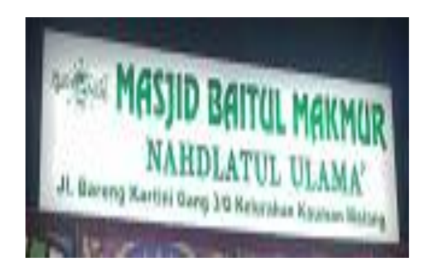
Figure 3. The name of a mosque with the Islamic organization

Christianity in Indonesia has sects, namely Lutheran (Lutherans), Kharismatik (Charismatics), Injili (Evangelicals), and Bala Keselamatan (Salvation). The religion of Islam in Indonesia, especially in Java, also developed Islamic organizations, namely Nahdlatul Ulama and Muhammadiyah. Islamic organizations certainly influence people's perceptions. The information displayed in the sign will support the perception of the community to decide whether to become worshipers or not.