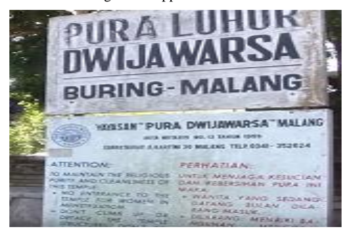
Figure 7. Prohibition sign

Other functions in the sign can refer to prohibited information. Prohibition signs are useful to limit activities that are dangerous, damaging, and detrimental to others. In a prohibition sign, the sign author provides information about the limits of the activities that are allowed and not. The prohibition arises because of repeated violations so that the signboard appears as an affirmation.