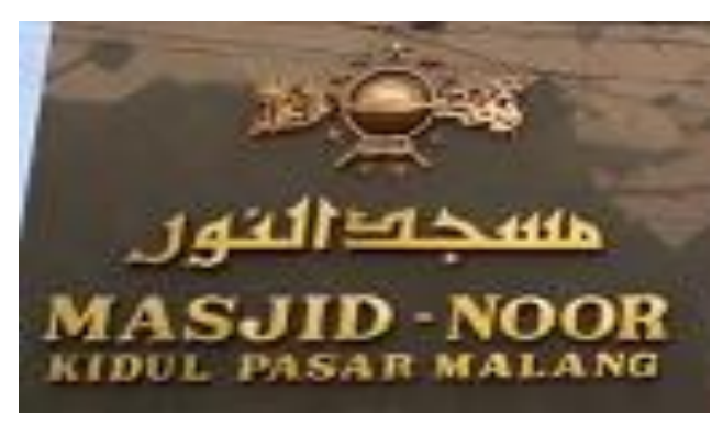
Figure 11. Multilingual Arabic, Bahasa Indonesia, and Javanese

Javanese is no longer considered an ancient language. Javanese is able to enter into the joints of modernity which substitutes the role of Arabic. Cahyaningati (light in the hearth) is the name of a mosque with modern architecture (see picture). Cahyaningati is a substitution phrase from An-Nur (light) where the second name is more popularly used in mosques in general. This substitution step with modern architecture is a symbol where locality is able to 'call' modernity. Local people who are predominantly ethnic Javanese are becoming increasingly aware that Javanese can take part in the arena of modernity.