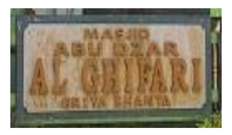
Figure 5. promotion through religion

Places of worship can also be a promotional medium. Promotion through religion is a more effective promotion model. The promotion has the aim of disseminating information about a product to potential customers, getting new customers, increasing sales and profits, differentiating and favoring products compared to competitors, shaping product images, and changing consumer behavior and opinions about the product.