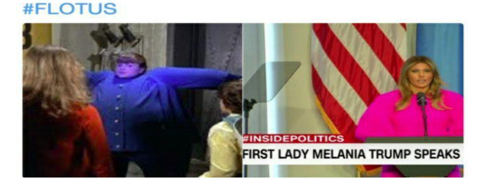
Figure 1. A Tweeter about Melania dress

For some reason it made me think of the blueberry girl from Willy Wonka. 😕