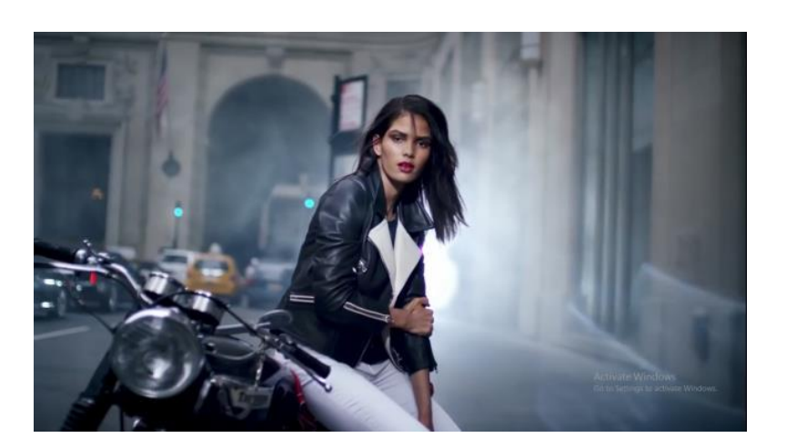
Figure 5. A Woman Sitting on a Motorbike

Figure 5 shows a woman sitting on a kind of motorbike that men are often seen riding. Her position is in the opposite direction to the vehicles behind her. She wears a black jacket and is seen pulling the sleeves up her wrist. Meanwhile, the background is Lincoln tunnel which is situated in New York with many vehicles on the road. There is also a light and fog moving slowly.