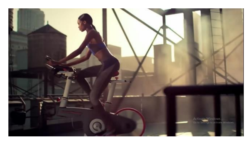
Figure 3. A Woman Doing Bike Workout

Figure 3 shows a woman in rigorous bike workout on a spinning bike. The woman wears a workout suit, and during the workout she keeps her focus forward. Behind her, a vague fog appears and there are also some tall buildings seen from afar that reflect New York city. How the model moves her legs in a fast pace represents passion, energy, and power. This part is parallel with the third verbal sign about involving passion in everything that women do. In addition, keeping her focus forward signifies that she is a future-oriented person. It also represents the lifestyle of people who live in New York. According to Scott (2007), New York is a hardworking city that is incredibly busy and focused. So, this confirms the nonverbal sign in figure 3, which shows a woman who spends her spare time doing a fast-paced workout and the way she keeps her focus straightforward.