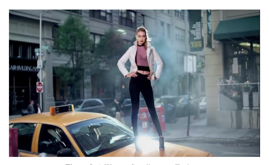
Figure 9. A Woman Standing on a Taxi

Figure 9 shows a woman standing on a taxi or a yellow cab in New York city. She stands with hands on hips and there is a light situated near her feet and at her back there is a sheer fog. In the background, there are typical New York buildings and many cars parked by the side of the road. The woman standing on a taxi exuding confidence is closely related with the verbal sign Stand tall and proud . She stands on the taxi to give the 'tall effect', and it requires high confidence level. In addition, this position also indicates how women deserve to be at a higher level or status in a society. The way she stands with hands on hips represents that the woman is ready to act. According to Pease (2004), this gesture is related to a goal-oriented person who is ready to tackle their objectives. Not to mention if the coat worn by the person is open and pushed back is directly aggressive because the person is openly exposing their front in a display of fearlessness. In addition, this position is reinforced if the person places the feet evenly apart. Therefore, the woman in this figure clearly exposes signs of aggressiveness and readiness to achieve any goal.