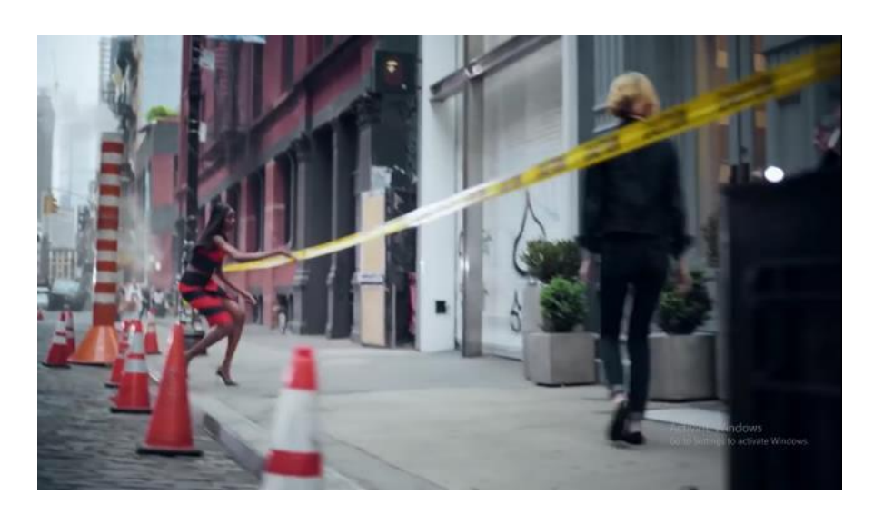
Figure 6. A Woman Running Through a Police Line

In figure 6 there is a woman who runs through a police perimeter tape by pulling it up. Near her, there are some traffic cones and behind her, from afar, there is smoke. The woman running through the police perimeter tape have connotative meaning, which represents obstacles being encountered by women in the process of getting what they wish. The action of pulling up the police line itself signifies that she tries to continue moving forward.