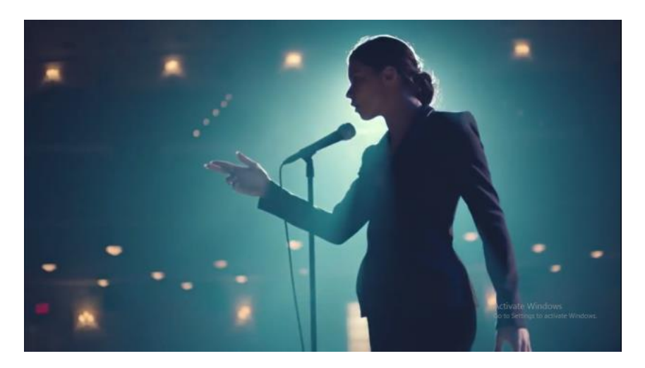
Figure 4. A Woman Doing Public Speaking

It can be seen in figure 4 that there is a woman speaking in public, dressed in a formal black suit. During her speech, she uses her hands to gesture, and the light is centered on her. This nonverbal sign