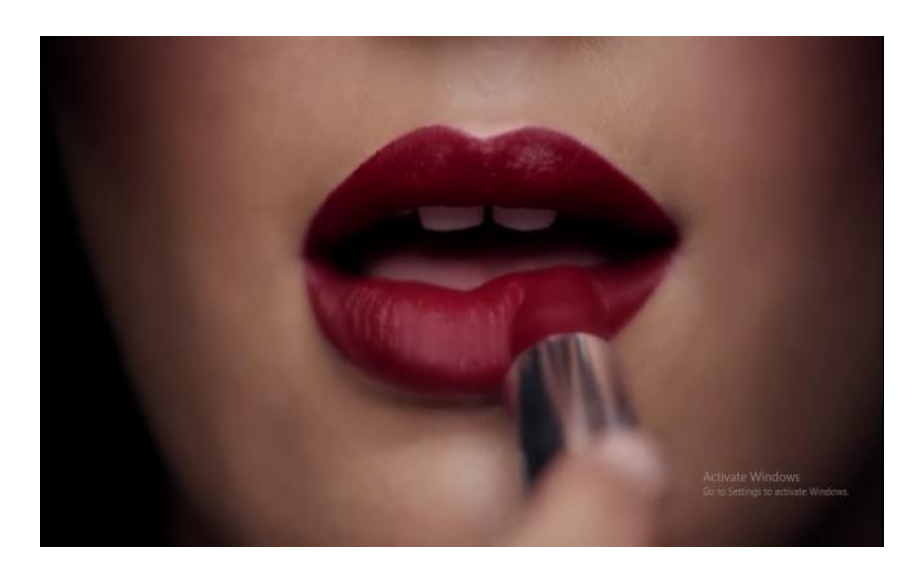
Figure 2. A Woman Applying Red Lipstick

As can be seen in figure 2, there is a woman applying a red lipstick right when the verbal sign Who apply passion emerges. This shows that Maybelline makeup is the passion itself. Not to mention, the color of the lipstick is red, and red is closely associated with passion. Olesen (2019) stated that red indicates strength and perseverance, and it can improve the self-confidence for those who are shy and lack in willpower. Therefore, Maybelline wants to inspire women to boost their self-confidence more and be determined. Thus, this nonverbal sign represents feminism since it projects women as positive personalities effusing self-confidence and determination. It is a fundamental point in upholding the equality that women deserve. Since, once women have their confidence and are determined, then they also draw the courage to speak up for the rights they deserve.