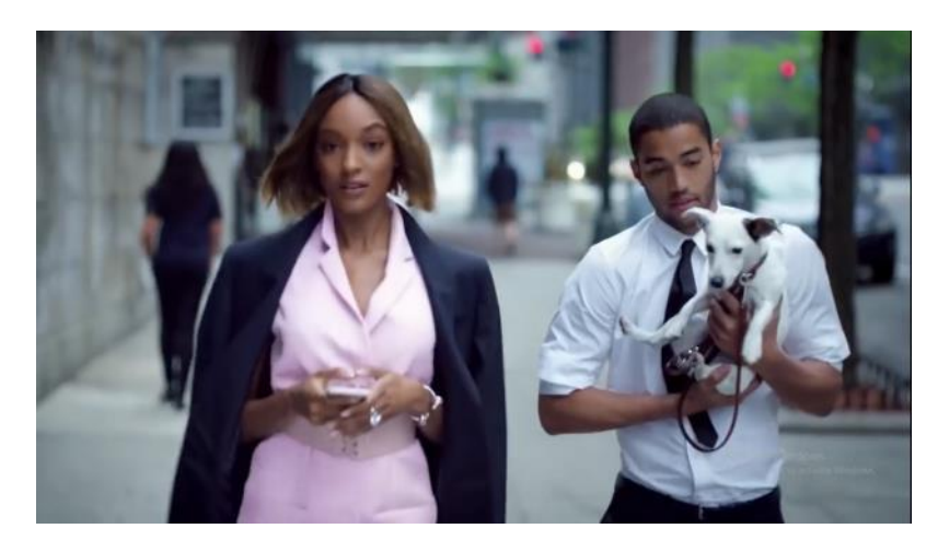
Figure 7. A Woman Walking with a Man

Figure 7 shows the previous model in pink dress wearing a black coat over her dress. According to Vasudev (2018), someone who wears a black coat looks more powerful and impactful. She walks confidently and holds a phone with her both hands. Besides her, a man walks and carries a white dog. He walks slightly behind the woman and is dressed in a black and white formal dress with a tie.