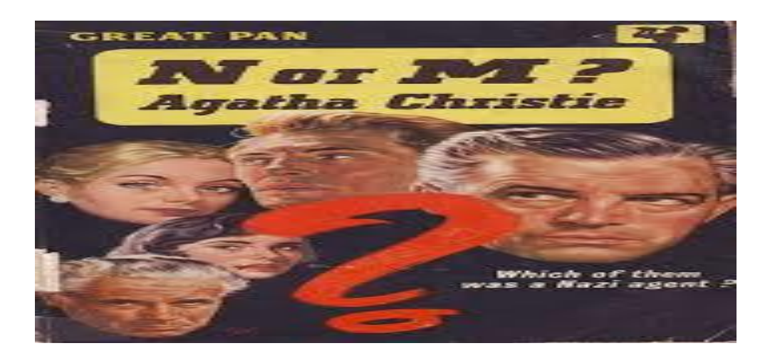
Sample 2 N OR M?

case caught a great deal of attention at the time, not only among the general public but also in the legal departments. The characters of his novels might be isolated, doomed to fate, lost or even face certain death, but Hilton's message is obvious: We Are Not Alone . It is not a suitable, over-emotional statement intended to provide an easy relief (in spite of his novel certainly offered solace to a weary readership between wars). Rather, his message resonates as the purest form of storytelling: the locution of shared experiences that lead us to more wisdom in times of distress (Hilton, 1937, p. 1).