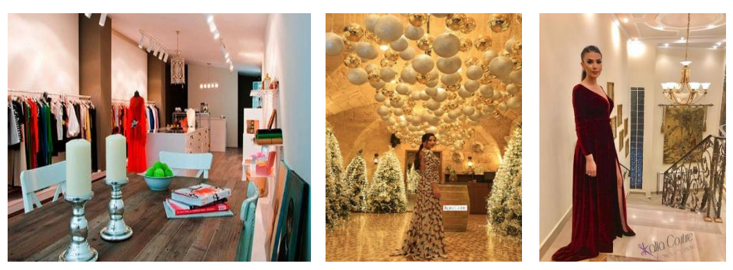
Figure (2) Figure (3)