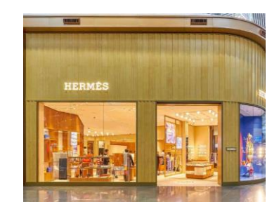
Figure (8)Figure (9)Figure (10)Figure (8, 9, 10) the pictures show the storefront, one of the spaces, the decoration of the display and<br/>the strength of the lighting.