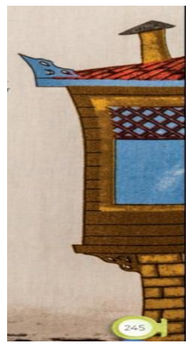
Visual 15 Visual 16