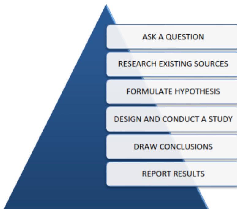
FIGURE 3: specific activities of SSI

The new framework for science education and the Next Generation Science Standards emphasise the importance of the development of science literacy and scientific practise by students. In order for these objectives to be achieved, students need to be able to conduct scientific investigations, analyse and explain data, use evidence to support claims and participate in scientific discussions. Teachers must be incorporated into a context in order to authentically incorporate these processes into their classroom. For this work SSI provides ideal contexts. The research framework we have presented is not intended as a step-by-step guide for teachers; rather, it is a template that provides the elements required for SSI-based teaching. Practitioners can use this model to include essential features when using SSI. Curriculum designers can use this framework to effectively integrate social issues with the content of science. This framework can be used by professional developers and administrators to help teachers implement SSI-based instructions. Finally, researchers could use this framework for the conceptualization and research of SSI-based instruction features. The framework that we have presented can be used by a variety of stakeholders to facilitate the implementation of SSI training in the classroom, and help students to develop scientific literacy and to engage in scientific practises.