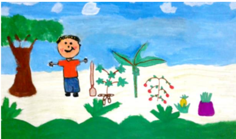
Figure 4. Drawing Pilar 6, municipality of Tibú, teenager 14 years old

The drawing presented below is the representation of the prosperous countryside dreamed of by the children and youth of Catatumbo, in which the farmer is related to the ecological factors of the context represented in the drawing such as grass, trees, fruits, soil, crops, reflecting expressions of hope, patience and longing, also the vision of peaceful countryside, with the right to cultivate, to healthy food and a farmer with guarantees.